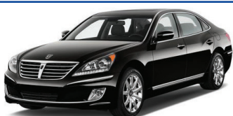
Hyundai Centennial (Limousine)