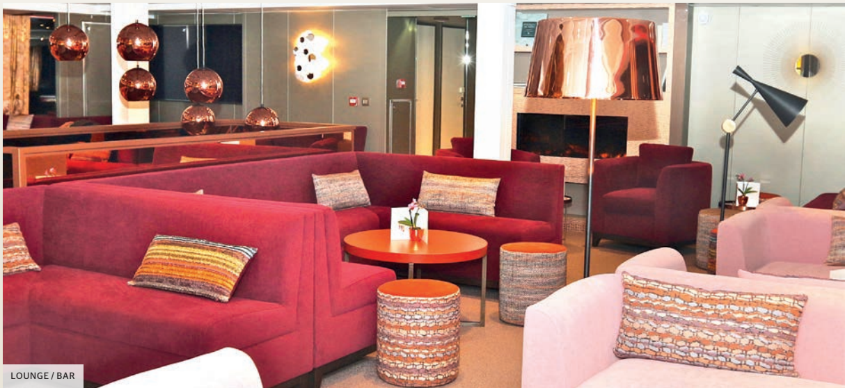
LOUNGE / BAR

The noble burgundy and pearly colors mingle with copper elements, which give a prestigious character to the interior decoration. A "royal" atmosphere to discover the Loire châteaux from the water. A nod to the famous "inexplosibles" that once crisscrossed the Loire: a large fireplace is located in the middle of the lounge.