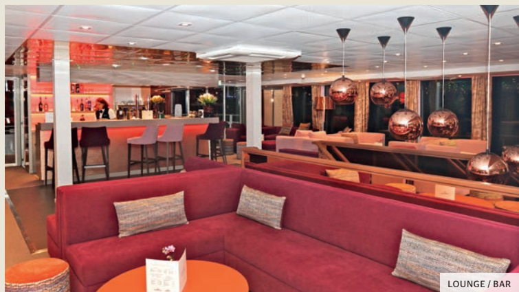
LOUNGE / BAR