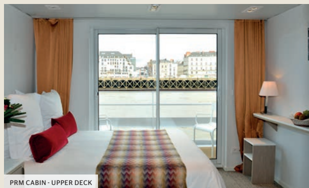
PRM CABIN - UPPER DECK

The sun deck has deck chairs and sun loungers ideal for relaxing. In the reception area you can admire the mechanism of the paddle wheels during navigation.