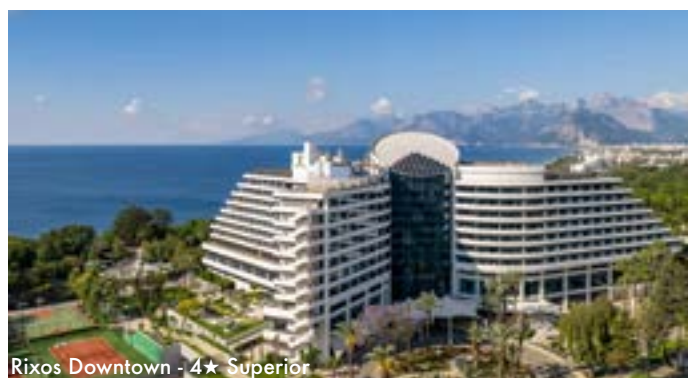
Rixos Downtown - 4★ Superior

31/7 to 7/8 7/8 to 14/8 14/8 to 21/8 21/8 to 28/8 28/8 to 4/9