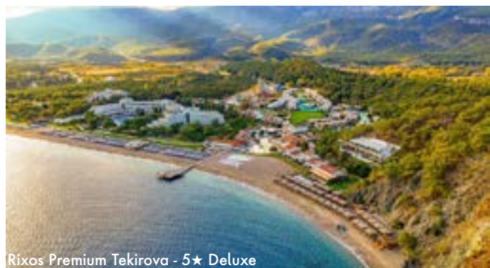
Rixos Premium Tekirova - 5★ Deluxe