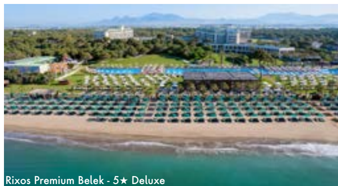
Rixos Premium Belek - 5★ Deluxe