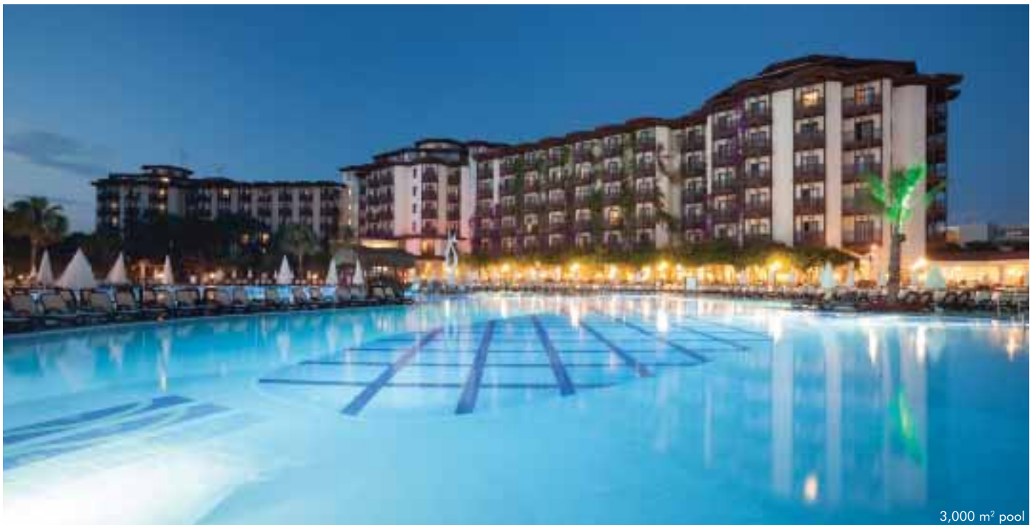
3,000 m 2 pool