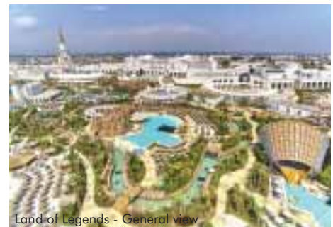
Land of Legends - General view