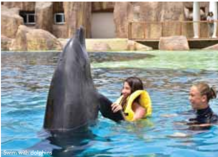
Swim with dolphins