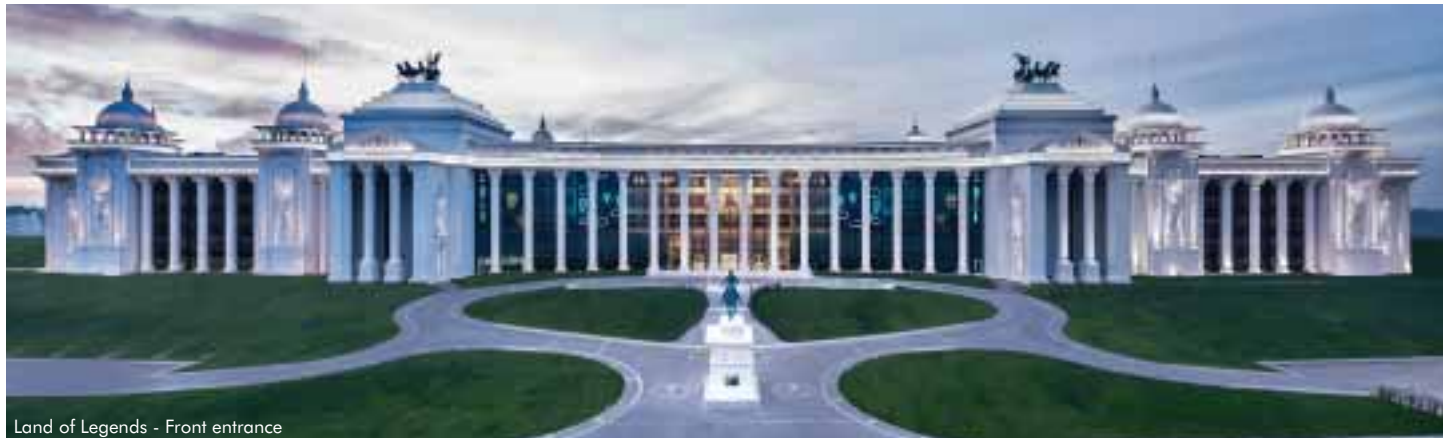
Land of Legends - Front entrance