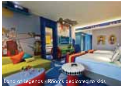
Land of Legends - Rooms dedicated to kids