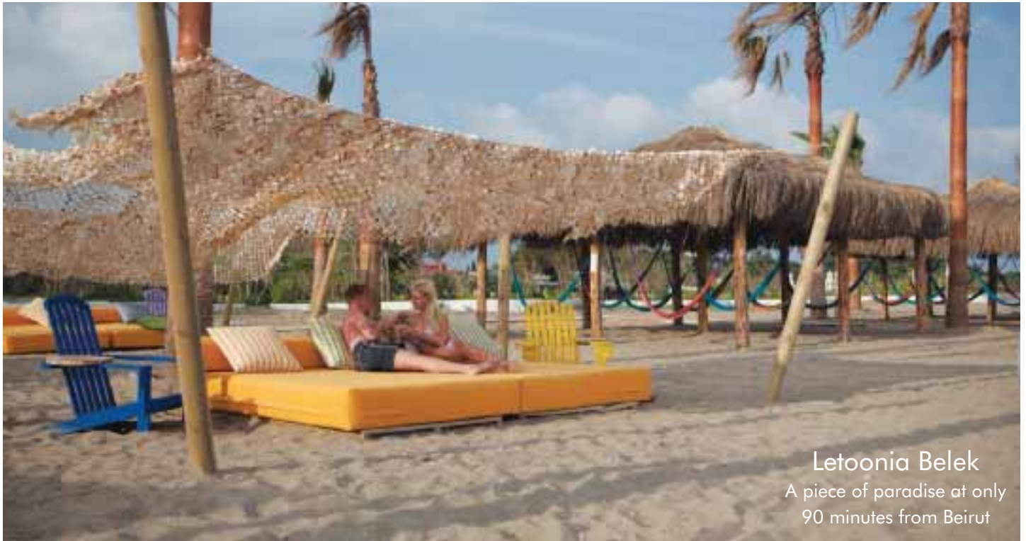
Letoonia Belek A piece of paradise at only 90 minutes from Beirut