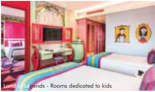
Land of Legends - Rooms dedicated to kids