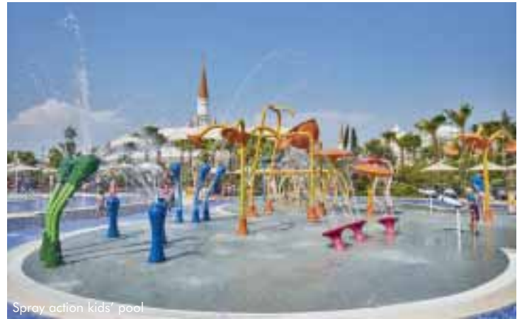
Spray action kids' pool