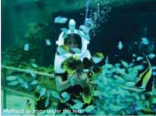
Mythical journey under the sea