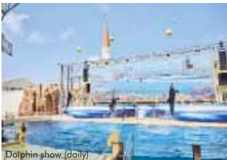
Dolphin show (daily)