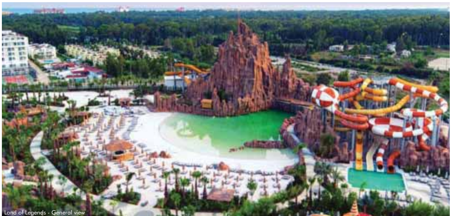
Land of Legends - General view