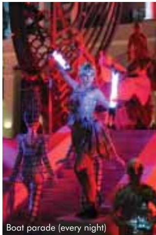
Boat parade (every night)