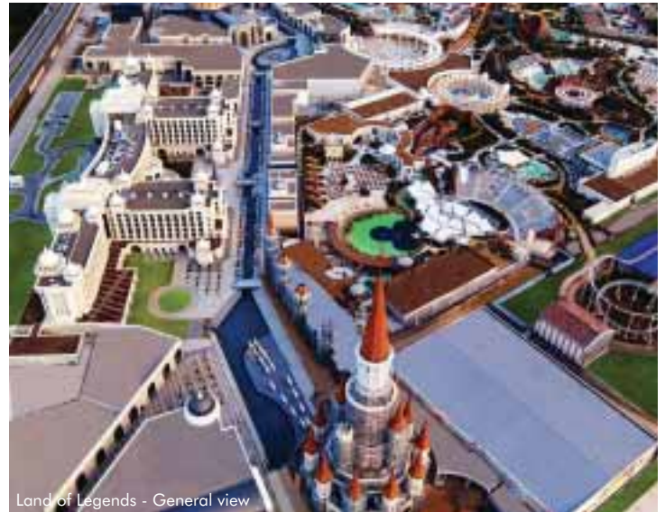
Land of Legends - General view