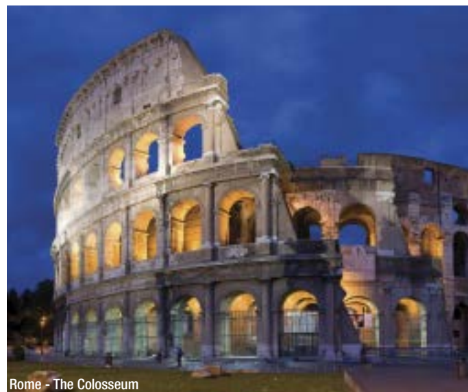
Rome - The Colosseum