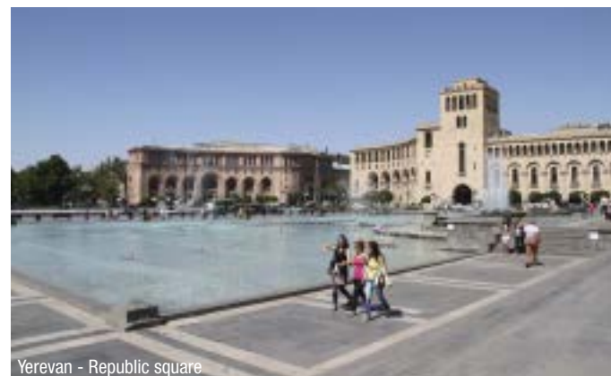
Yerevan - Republic square