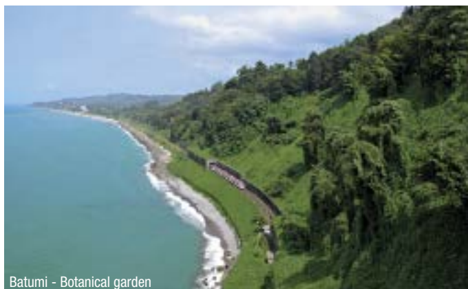
Batumi - Botanical garden