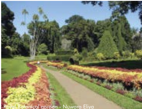
Royal Botanical garden - Nuwara Eliya