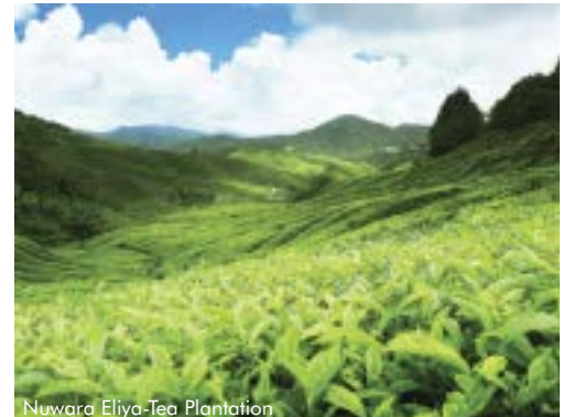
Nuwara Eliya-Tea Plantation