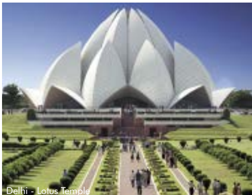
Delhi - Lotus Temple

18:15 Arrival to Beirut International Airport.