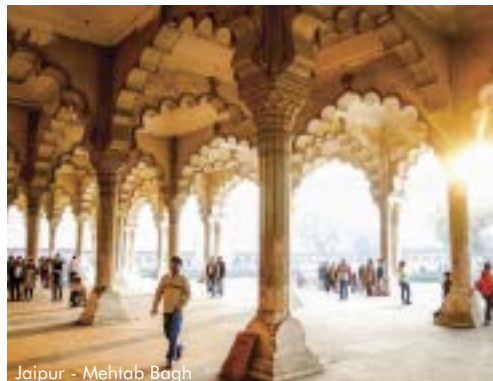
Jaipur - Mehtab Bagh