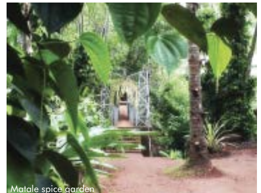
Matale spice garden