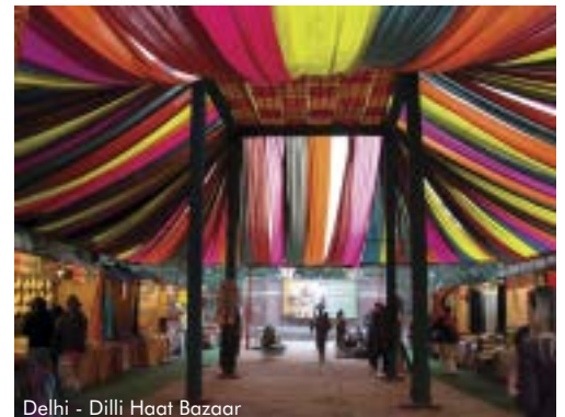
Delhi - Dilli Haat Bazaar