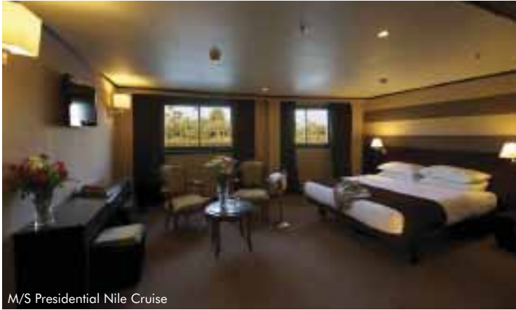
M/S Presidential Nile Cruise