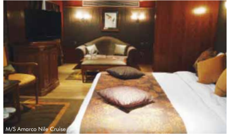
M/S Amarco Nile Cruise