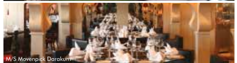
M/S Movenpick Darakum