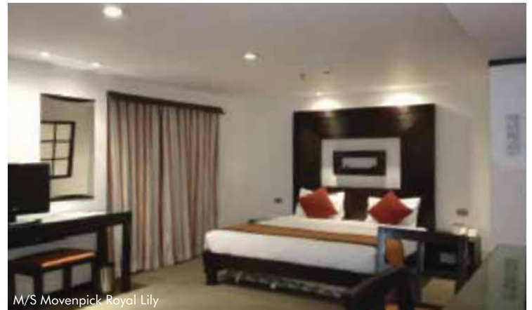
M/S Movenpick Royal Lily