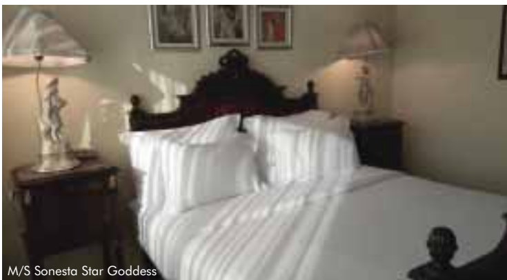
M/S Sonesta Star Goddess