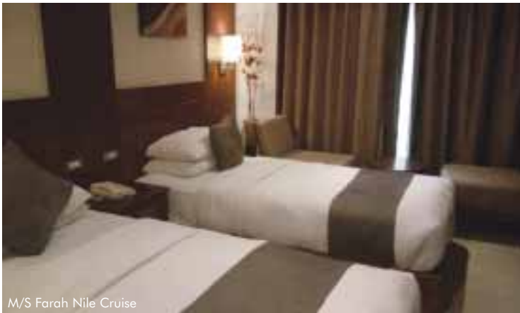
M/S Farah Nile Cruise