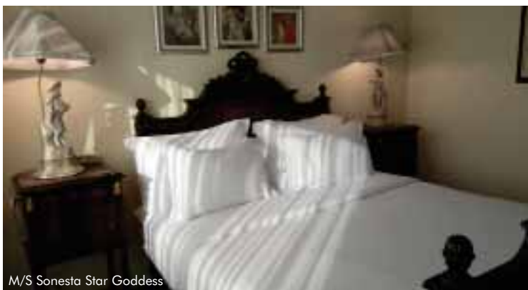
M/S Sonesta Star Goddess