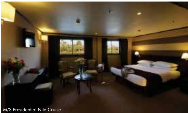
M/S Presidential Nile Cruise