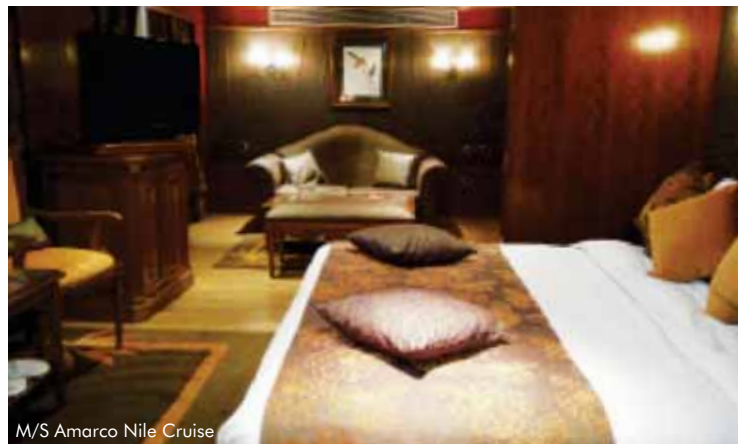
M/S Amarco Nile Cruise