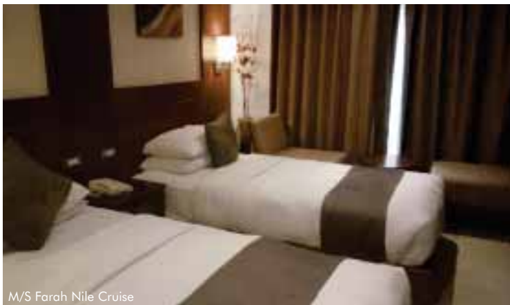
M/S Farah Nile Cruise