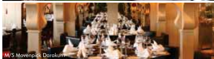
M/S Movenpick Darakum