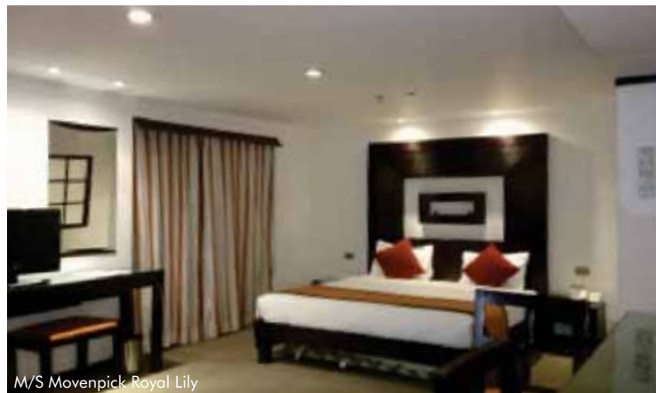
M/S Movenpick Royal Lily