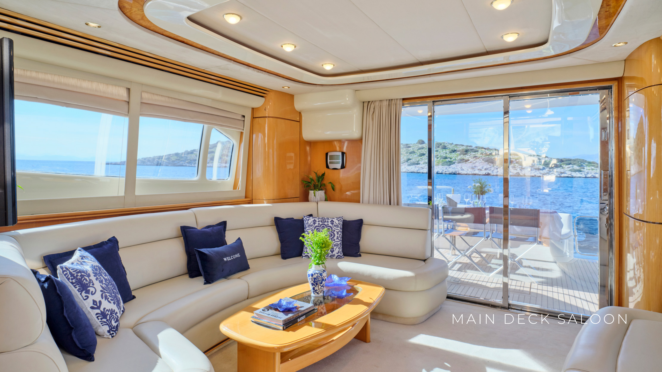
MAIN DECK SALOON