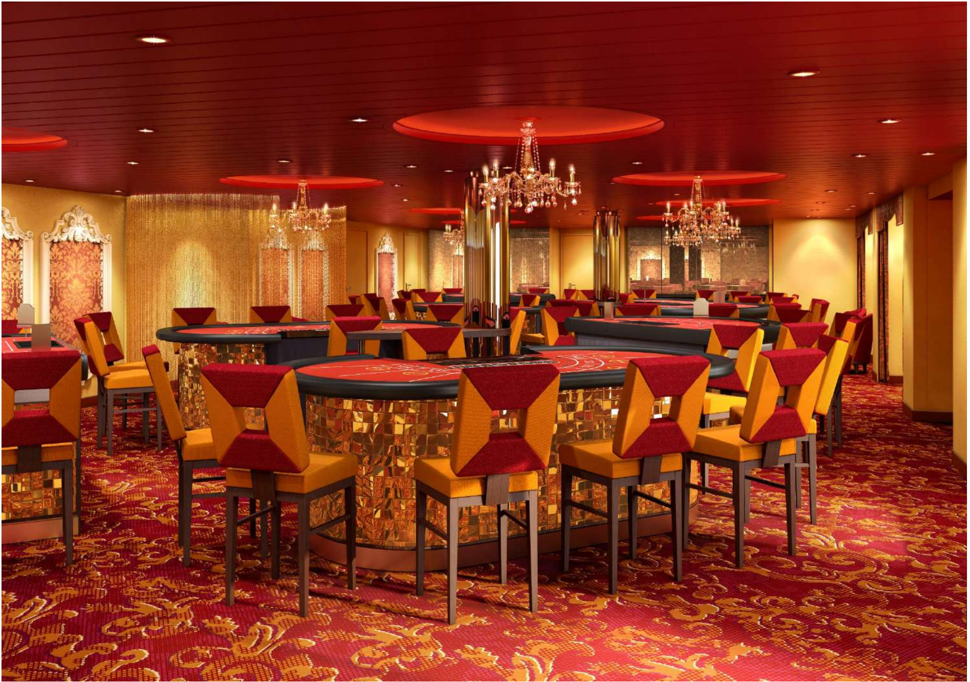
Casino di Venezia