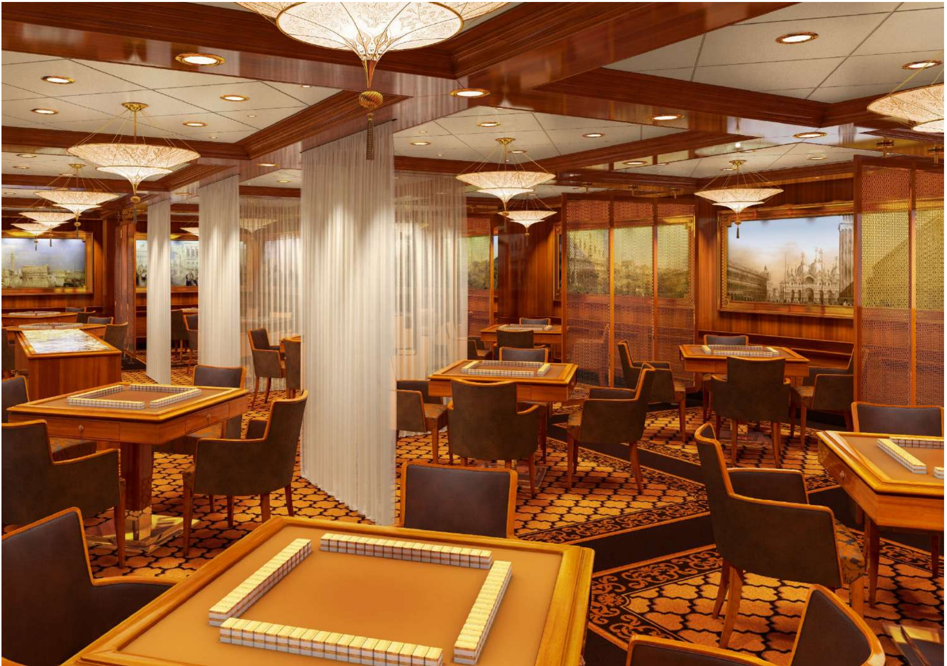
Casino di Venezia