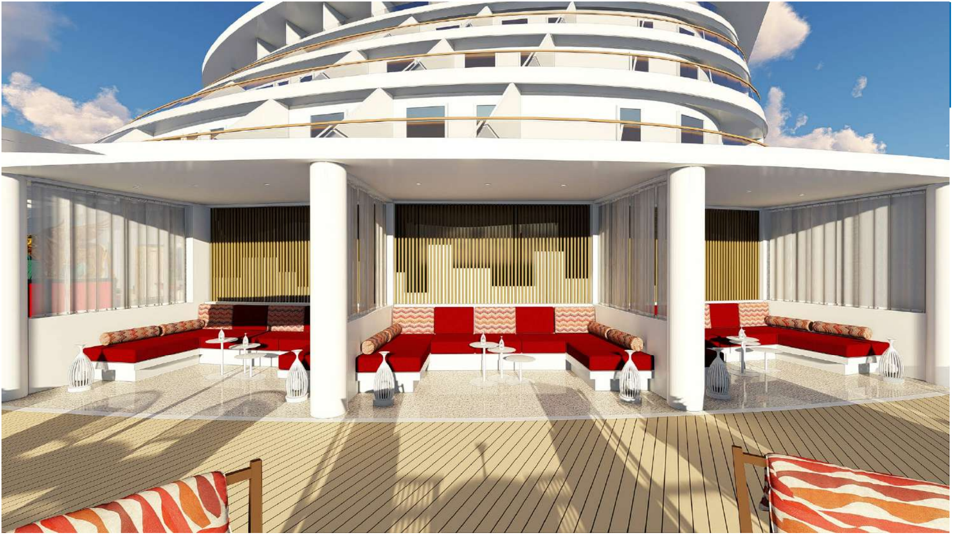
Lounge delle Stelle