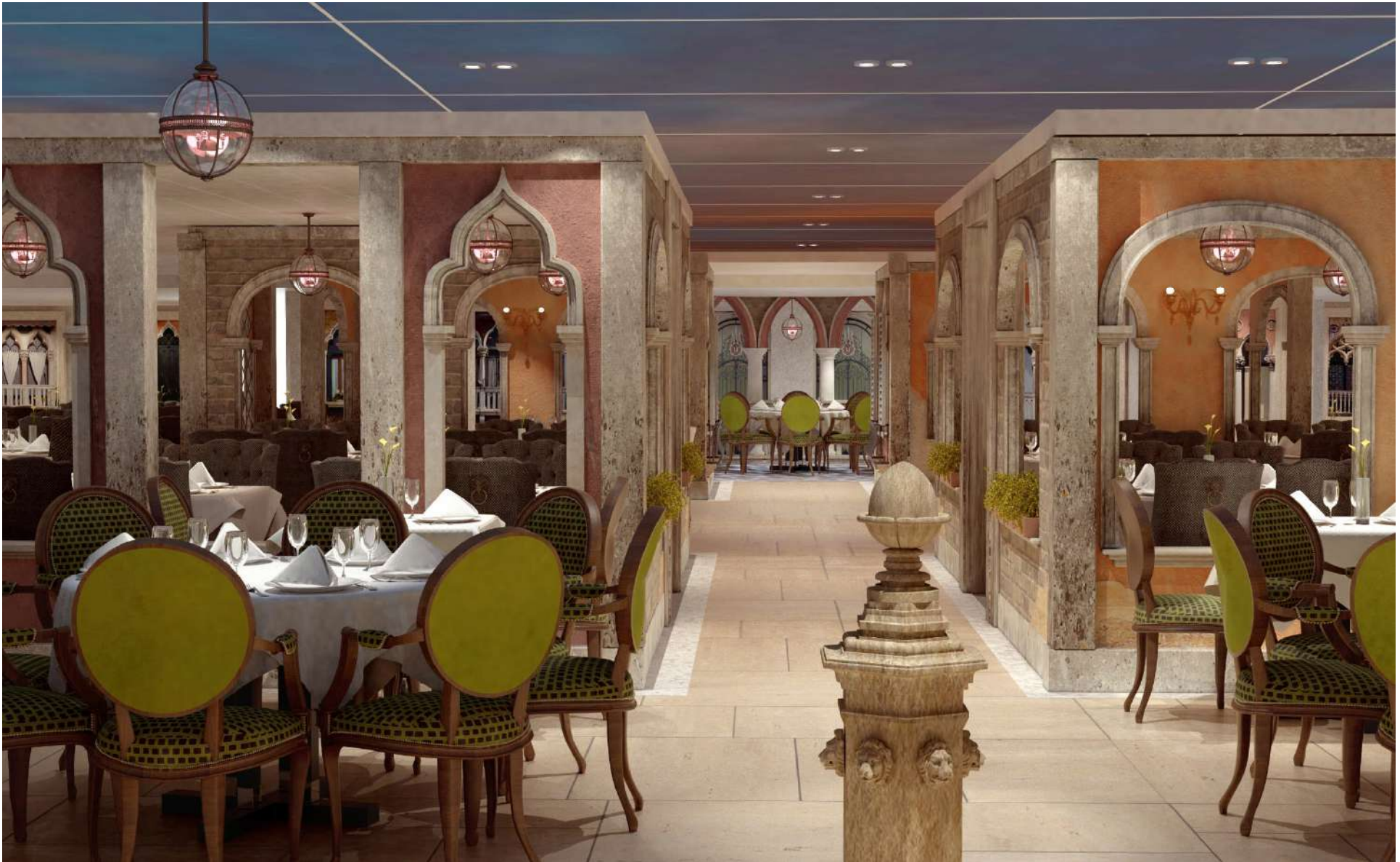
Marco Polo Reastaurant