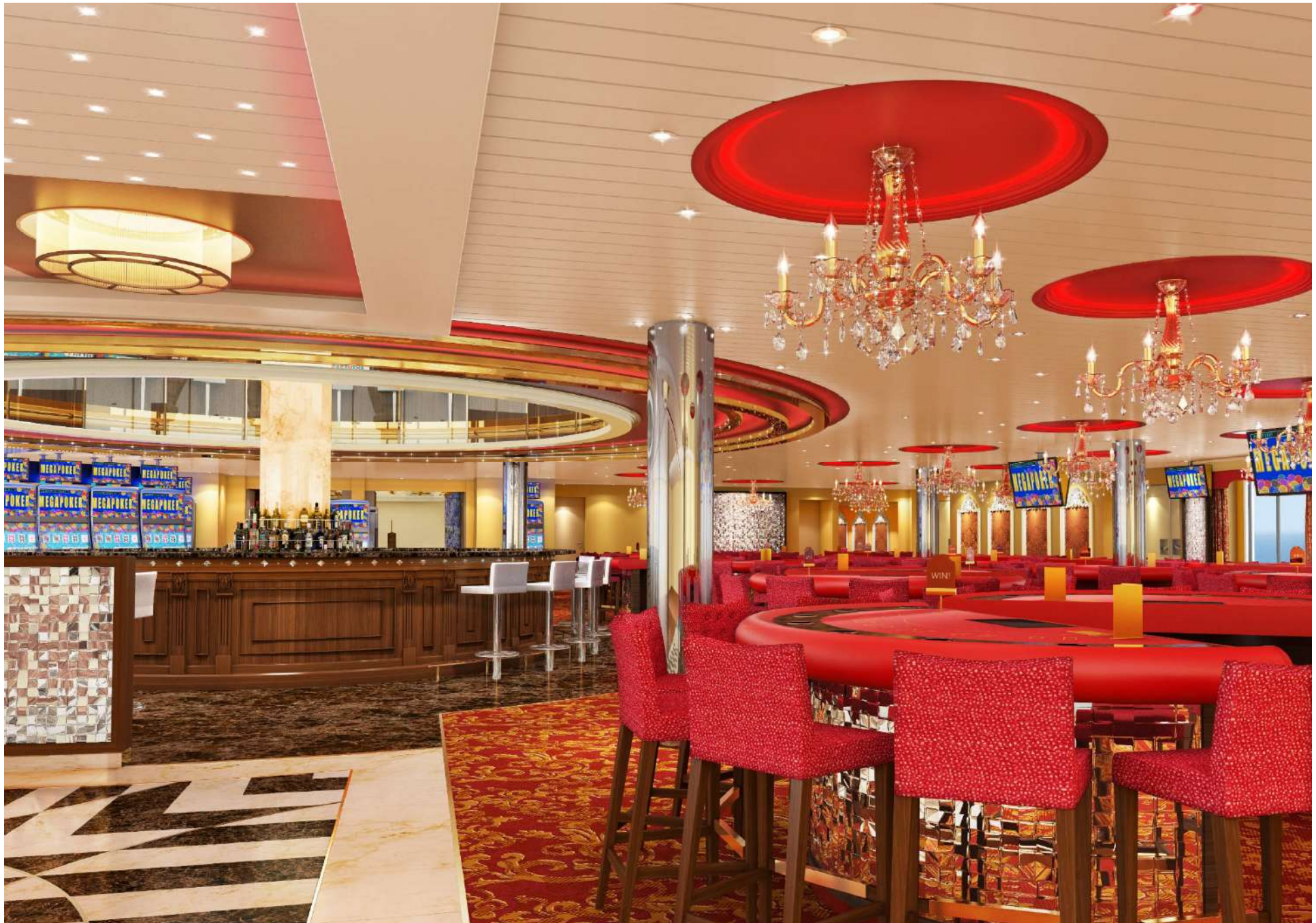
Casino di Venezia