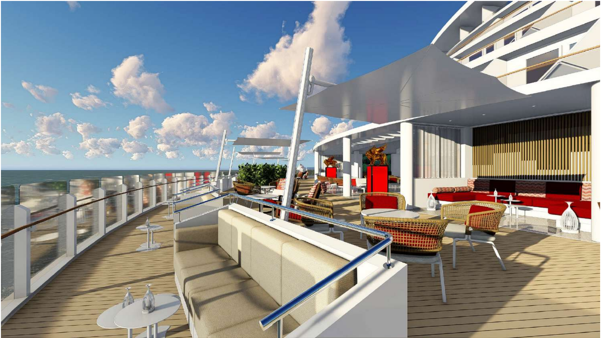
Lounge delle Stelle