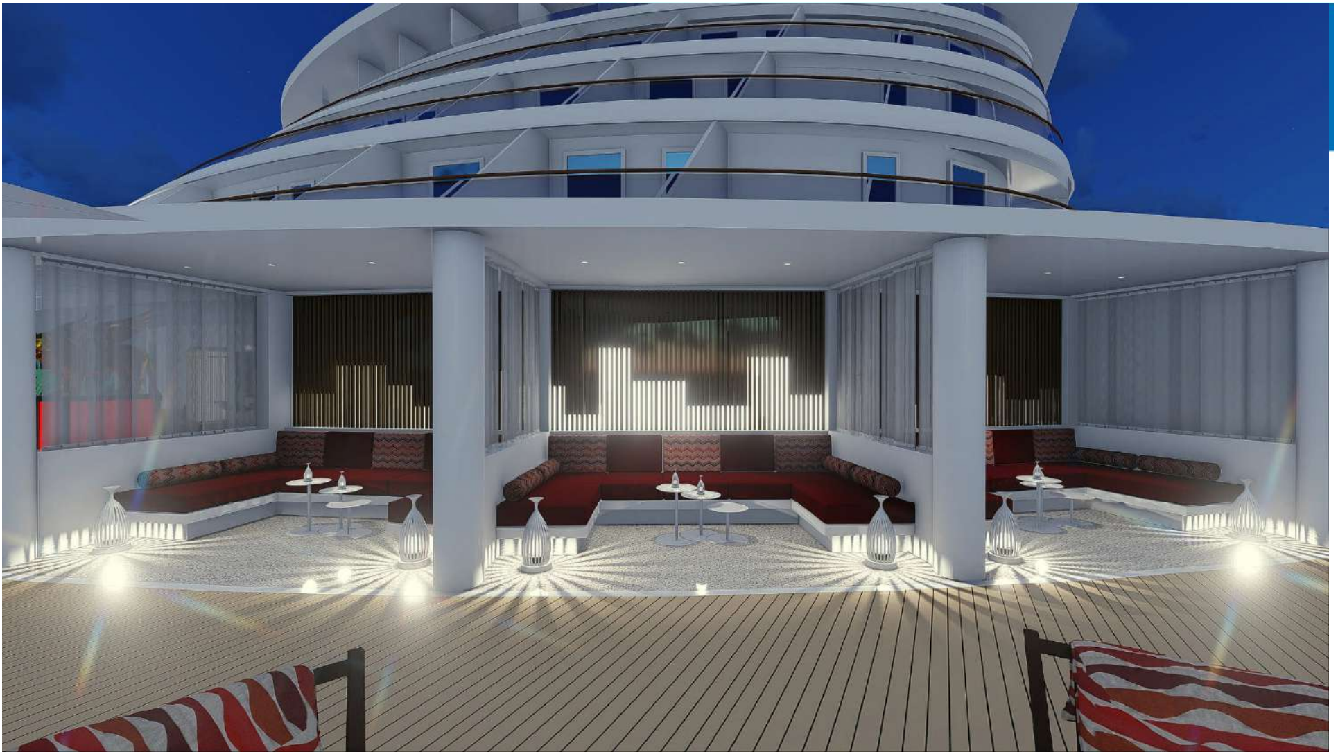
Lounge delle Stelle... by night