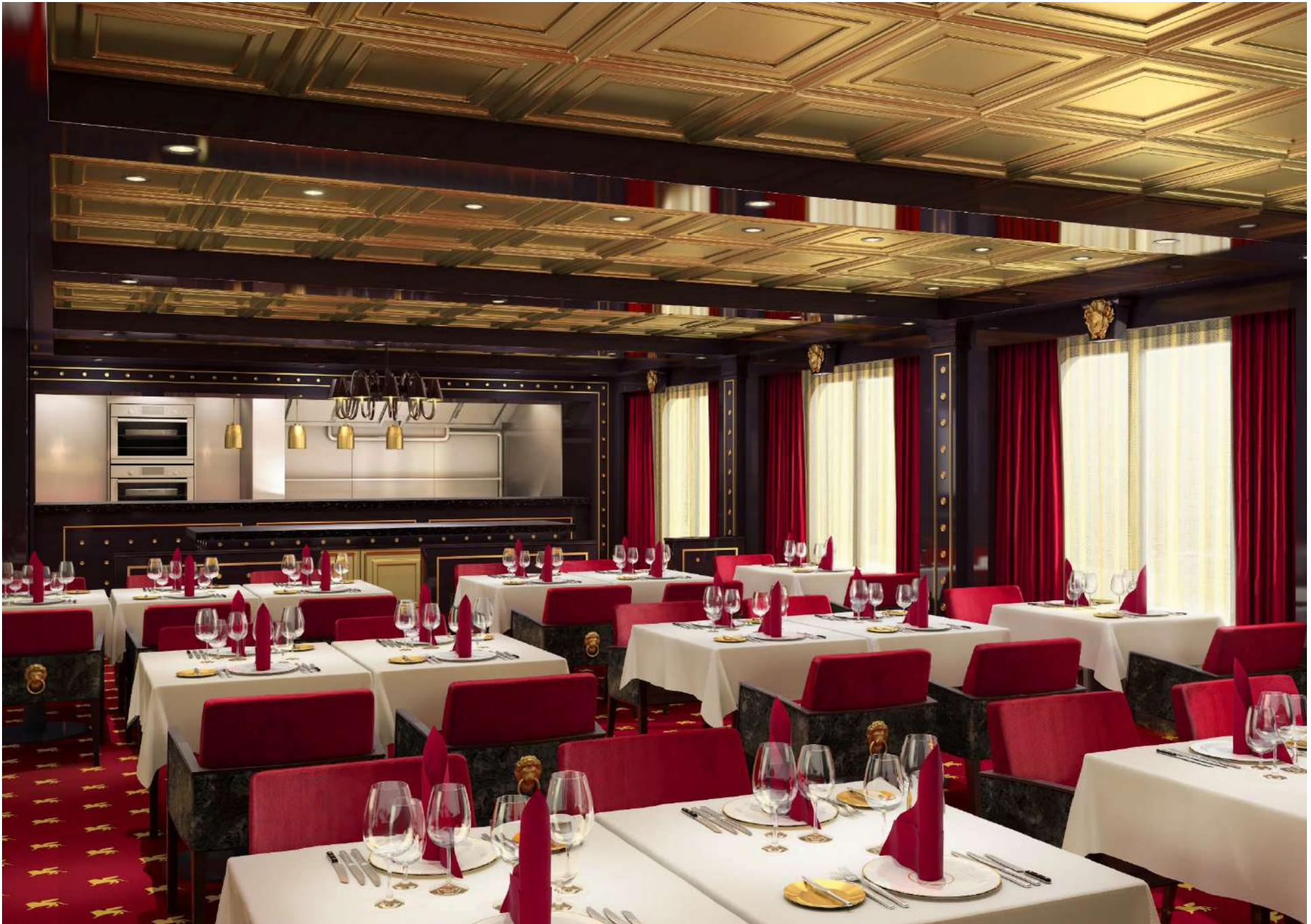
La Fiorentina Steak House