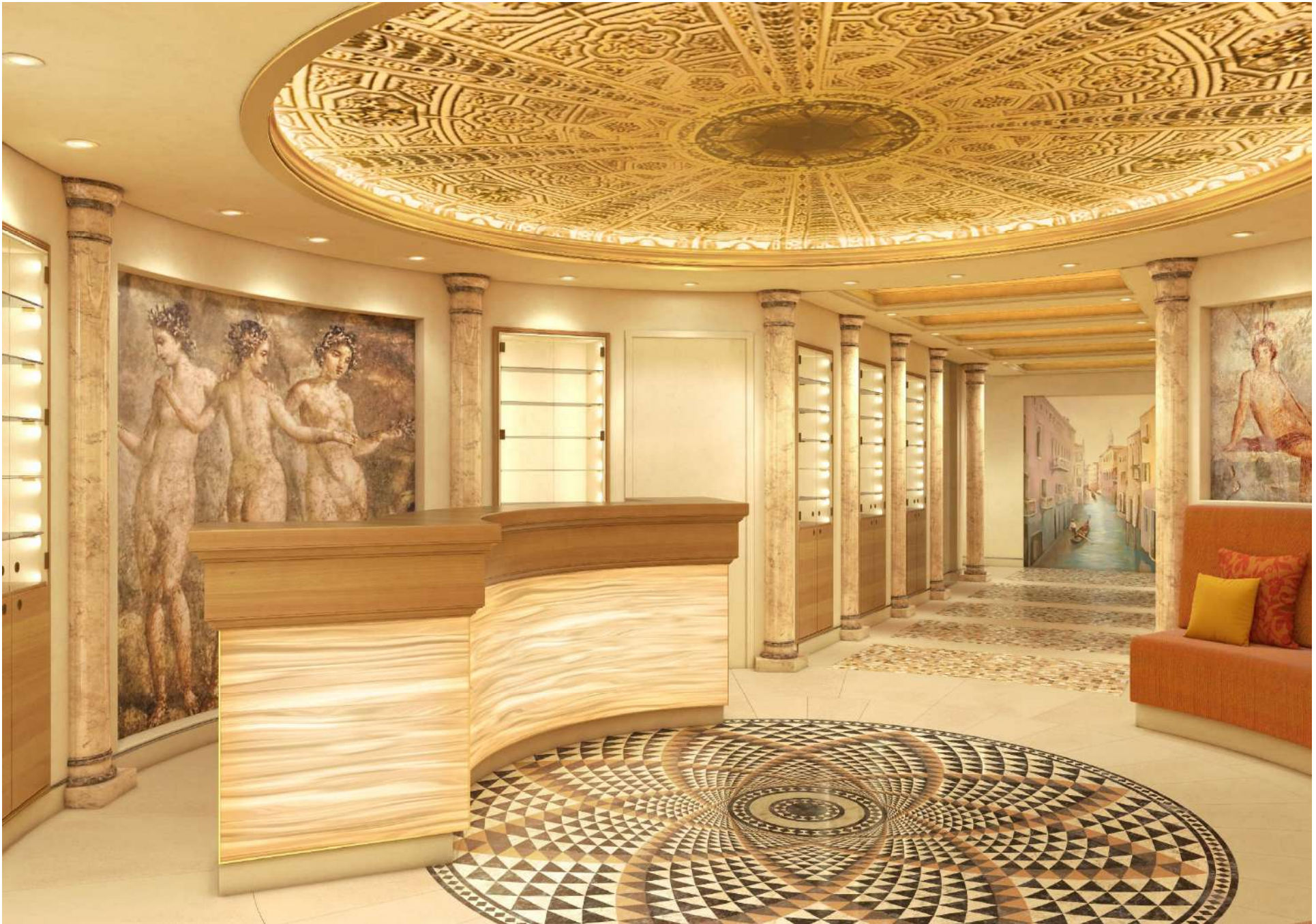
Spa Bellezza - Reception