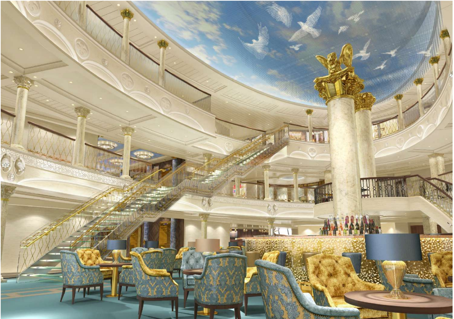
Piazza San Marco