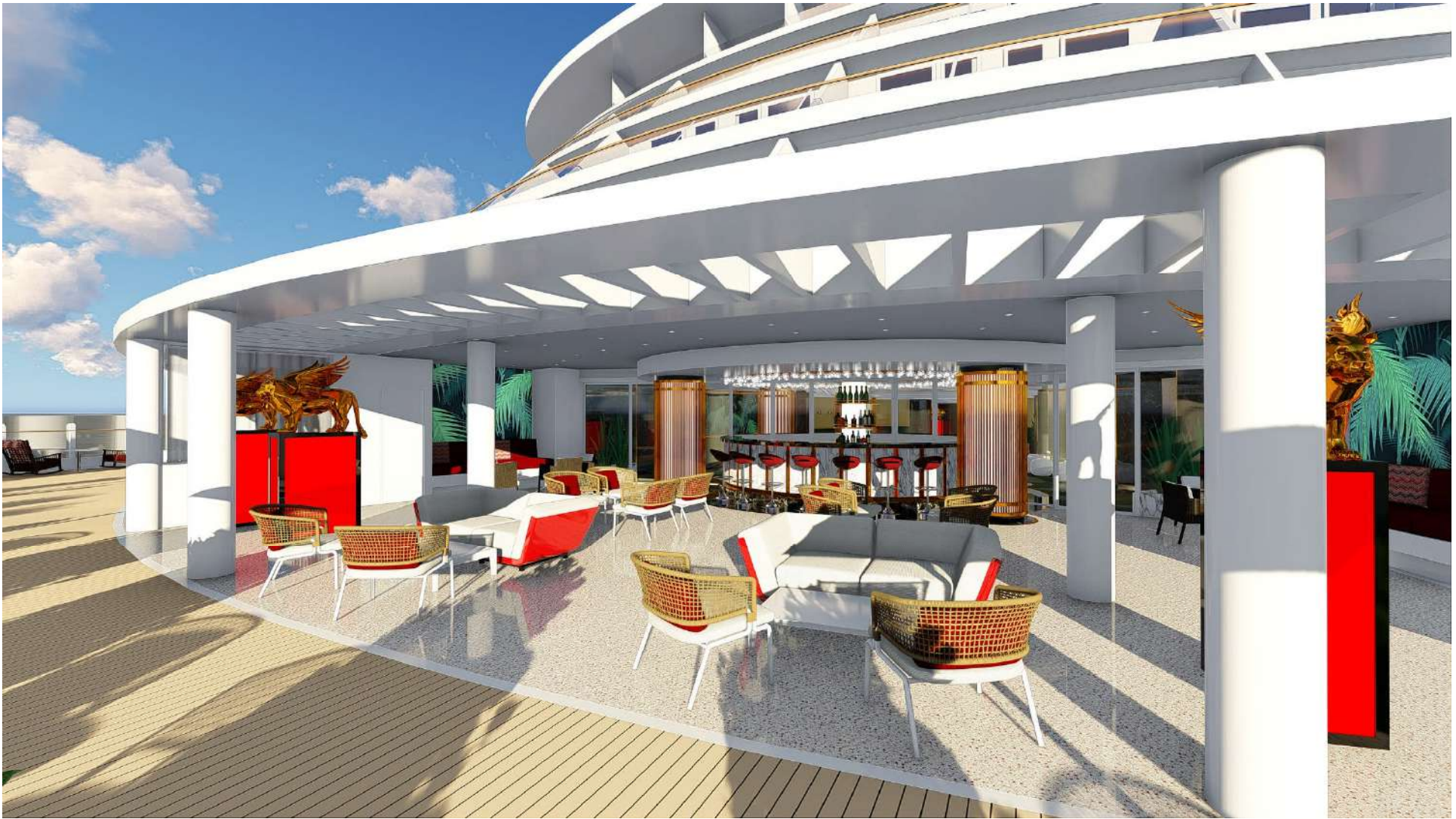
Lounge delle Stelle